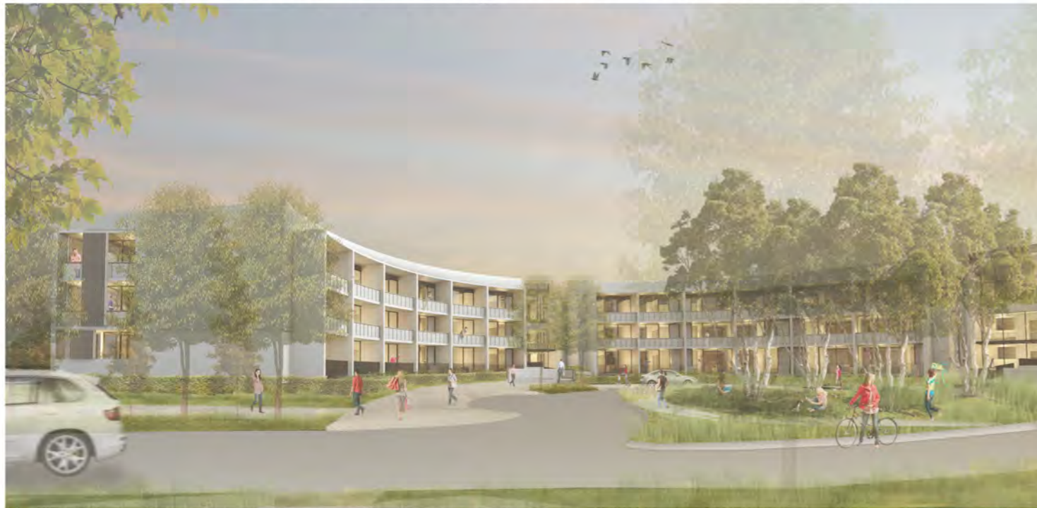
VIEW 2 BLOCK 31C SECTION 162 PHILLIP. ARTIST IMPRESSION OF EASTY STREET APPROACH