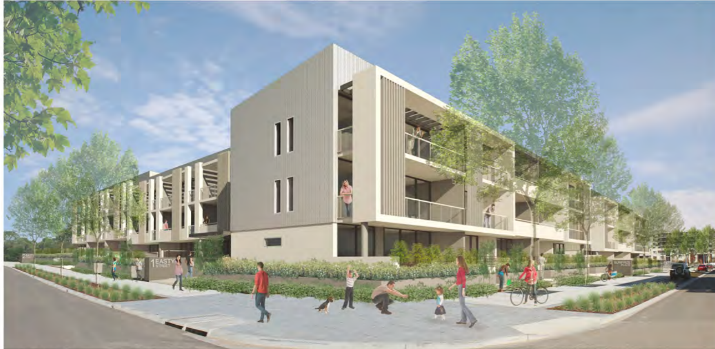
VIEW 1 BLOCK 31A SECTION 162 PHILLIP. ARTIST IMPRESSION OF EASTY STREET APPROACH