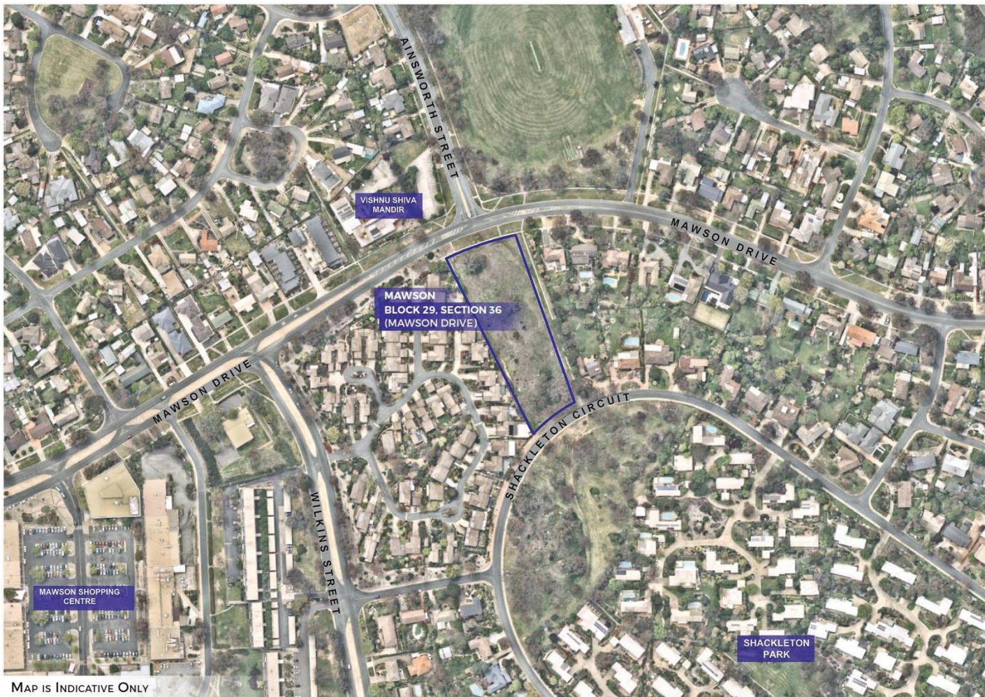
MAP IS INDICATIVE ONLY